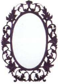
Mirror Tropique , 108x71cm, £350, Le Tramac, 0778 984 5056, letramac.com.