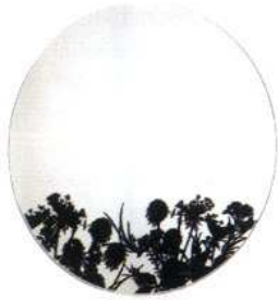
Silhouette mirror , with black wood veneer design, 76cm, £302.50, Amaroni, 01205 260384, amaroni.com.