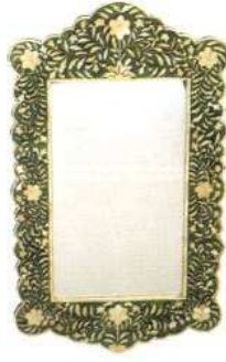
Mirror with bone inlay, 80x48cm, £135, Graham & Green, 0845 130 6622, grahamandgreen.com.