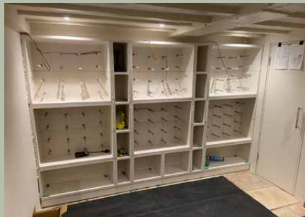
6. Lighting integrated as building progresses