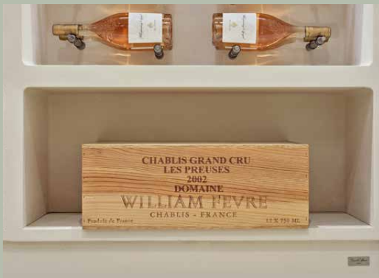
Double bin for case-on-side storage