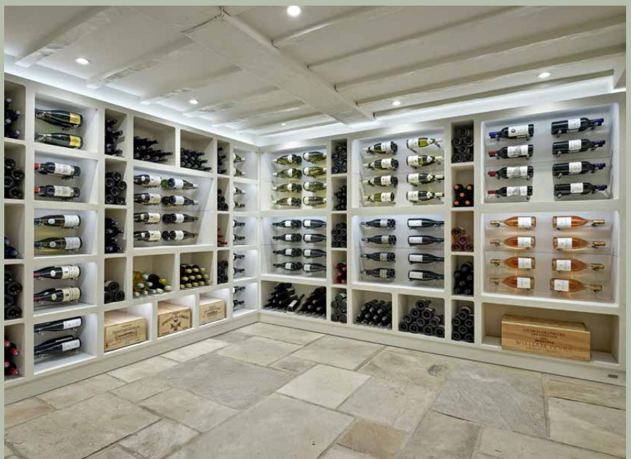
9. The finished room