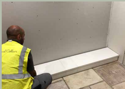
3. Floor plinth laid along dominant wall