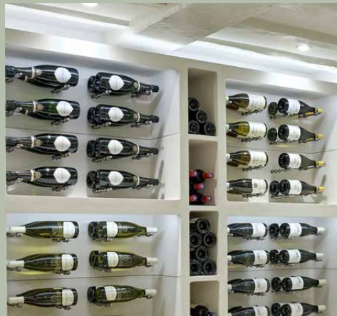
Pelmet-edge lighting creates a feeling of space

To find out more about our products and services, please visit our website or contact our Customer Adviser team.