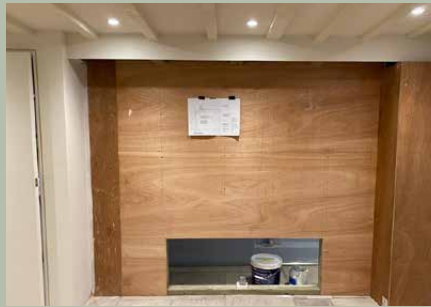
1. Room clad in plywood

Once completed, the Spiral Cellars install team were back on site where it took just under 2 weeks to fully install the UnSpiral Cellar.