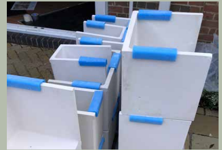
2. Modules arrive on site and are unwrapped