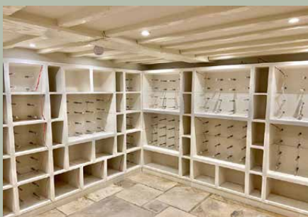
8. Awaiting final fix electricals