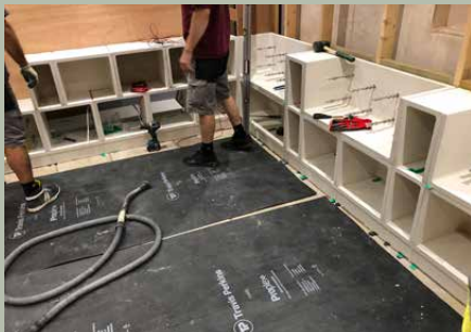
5. Modules are laid sequentially row by row