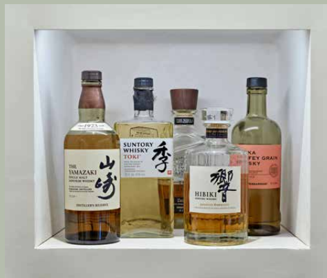
Bins allow for vertical bottle storage