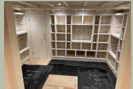
7. Build complete and ready for finishing works