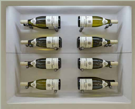
16 bottle display with LED