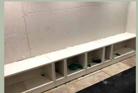
4. First row of modules are laid on top of the plinth